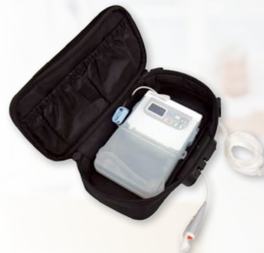
Carrying bag with programmable lock and exit for bolus cable and IV line

Easy to use, versatile, compact and ambulatory.